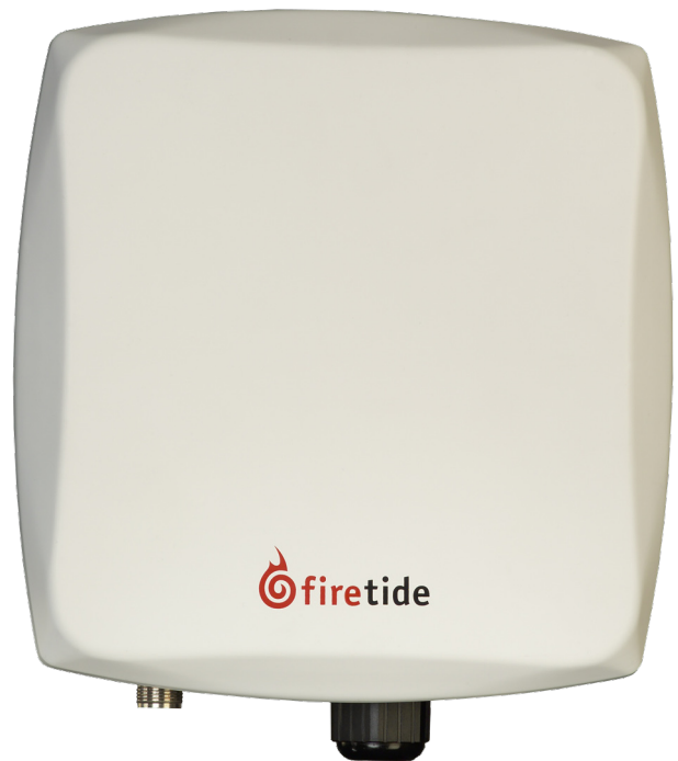
Model 2200 Outdoor CPE