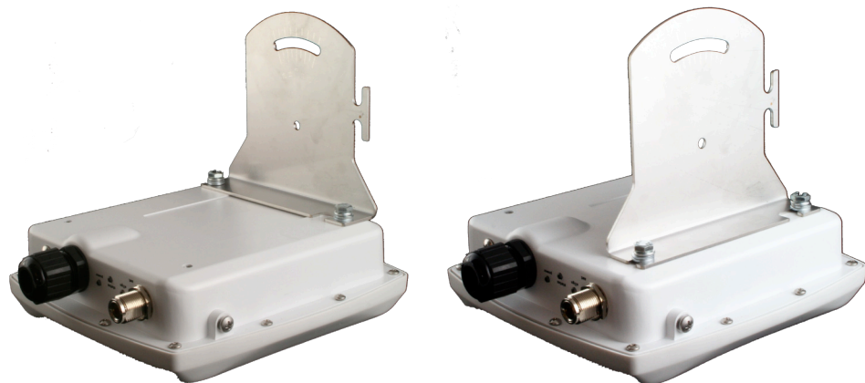
Figure 7. Attaching the Bracket to the HotClient

Attach the bracket to the back of the HotClient, using the two slotted holes shown on the right side of the bracket, as shown in Figure 5. Select two holes on the HotClient according to the desired orientation of the pole and the antenna, as shown in Figure 7.