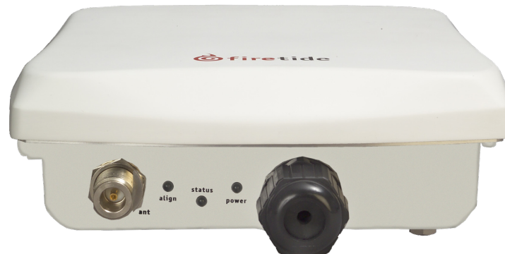
Figure 6. HotClient Outdoor Unit Connections

Attach the bracket to the back of the HotClient, using the two slotted holes shown on the right side of the bracket, as shown in Figure 5. Select two holes on the HotClient according to the desired orientation of the pole and the antenna, as shown in Figure 7.