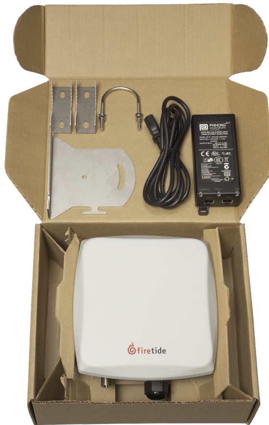
Figure 4. Series 2200 Outdoor Unit - Package Contents

The cable must be a 4-pair cable; smaller cables will not seal in the waterproof connector. The cable can be pre-terminated; the waterproof connector will pass an RJ-45 plug.