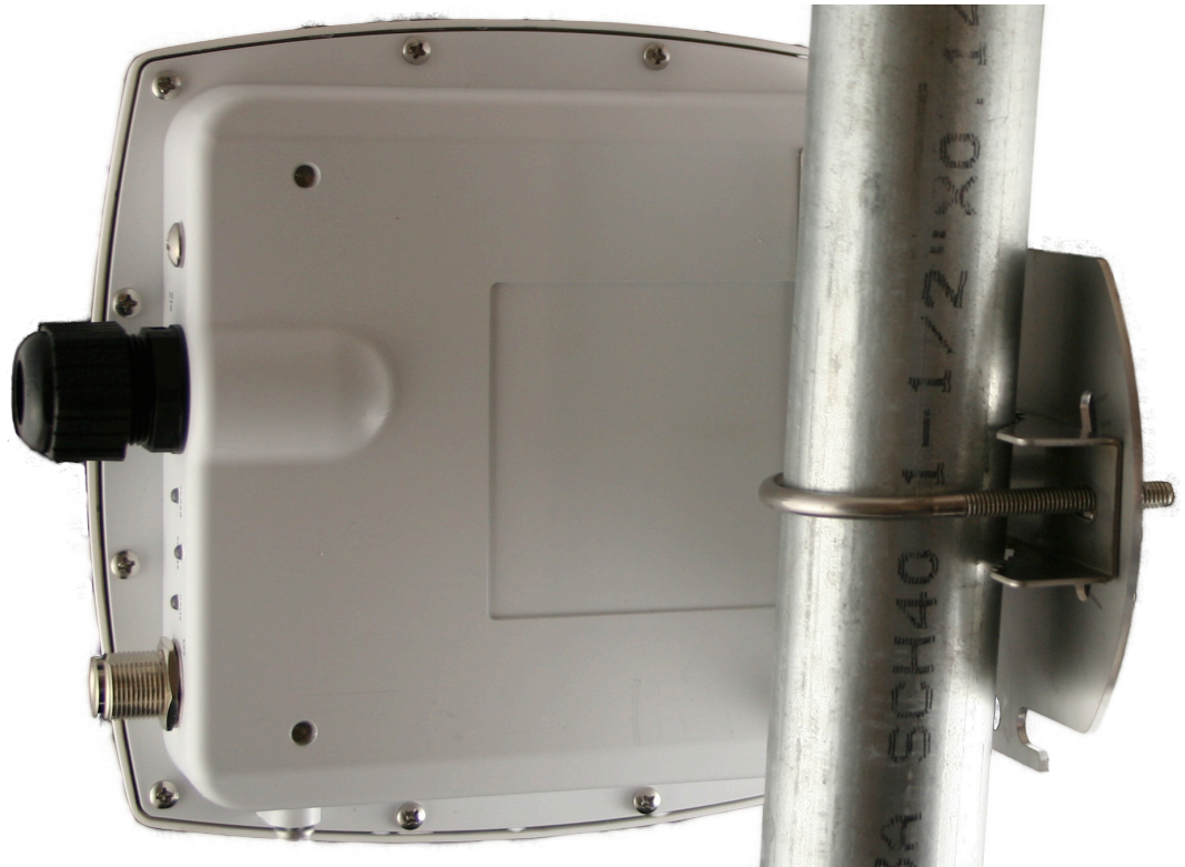
Figure 8. U-bolt Mounting Assembly

After placing the U-bolt around the pole, place the bracket over the legs of the U-bolt such that one leg passes through the round hole and the other leg passes through the curved slot. Snug the bracket slightly with the supplied nuts and lockwashers, but do not tighten until you have aligned the unit. The result should resemble Figure 8.