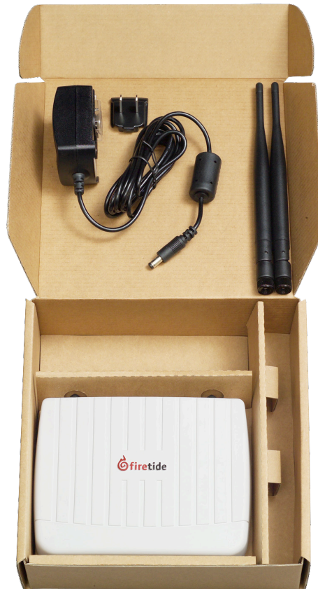
Figure 1. Series 2100 Indoor Unit - Package Contents

Your Firetide equipment needs to connect via a standard Ethernet (RJ-45) cable to your computer or home network. Pick a suitable location for the device, and use the supplied power supply to provide power to the unit. The Power LED should illuminate immediately. Attach the supplied antennas to the two antenna connectors. Tighten them firmly, by hand, and point them vertically.