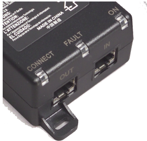
Figure 3. Power-Feed Unit Connections.

Connect the device to your PC or home network via the RJ-45 connector. A crossover cable is NOT required. Your Internet Service Provider has pre-configured your device. Set your computer to obtain an IP address automatically (DHCP) and you can connect to the Internet.