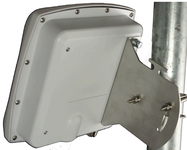
Figure 9. Tilting the Unit for Signal Alignment

The Alignment LED provides a visual indication of signal strength. Point the HotClient in the direction of its signal source, then carefully adjust it, both horizontally and vertically, using the Alignment LED as a guide. When you receive the strongest signal, tighten the nuts. Figure 9 shows how the bracket can be used to tilt the unit.