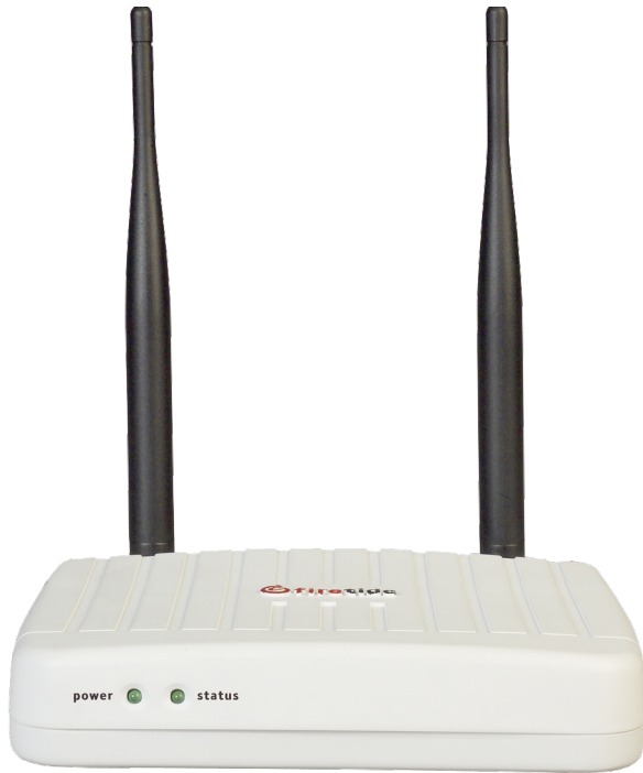
Model 2100 Indoor CPE