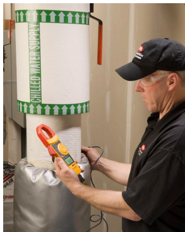
Some electrical test tools, such as this Fluke 902 Clamp Meter, offer temperature measurement too, making it easier to build in temperature checks.