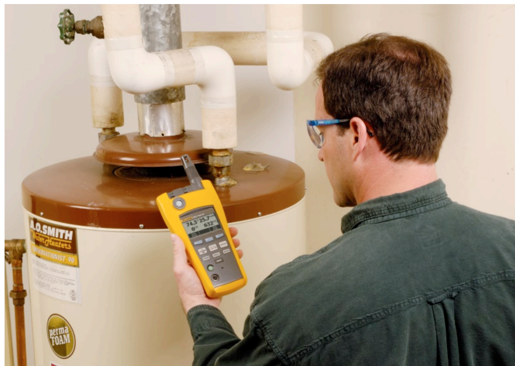
When taking readings near any combustion equipment, measure not only CO but CO 2 and temperature as well.

✓ Cooling tower checks: For cooling equipment to operate at its most efficient levels, the cooling tower must operate properly. Since cooling towers reject heat at a specific rate to the atmosphere, use a temperature/humidity meter to measure the outside air temperature and humidity and analyze cooling tower operation. Also measure the temperature of the condensing water supplied to the chiller. A common value is 85 °F.