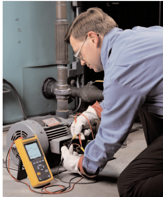
Using the Fluke 43B Power Quality Analyzer for average watt measurements.

On the three phase 430 power quality analyzers, the energy function automatically measures and calculates Watts/VA/VARs. Simply connect the clamps and leads and select energy from the menu.