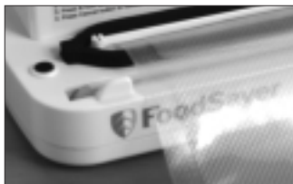
Place Bag in Vacuum Channel