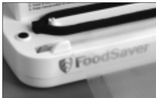
Place Bag on Sealing Strip