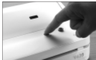
Press Open/Cancel Button