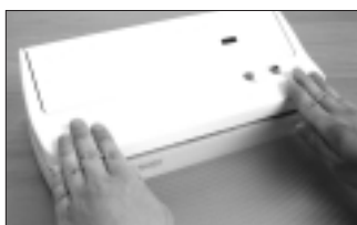
Press and Release Lid