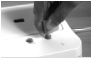
Insert Accessory Hose