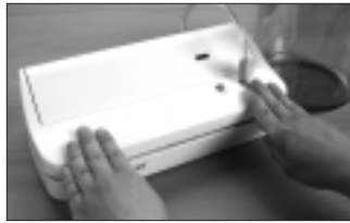
Press and Release Lid