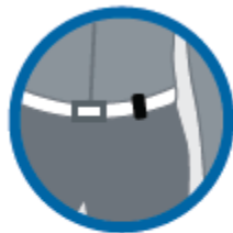
clipped to your belt or waistband