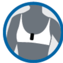
clipped to your bra strap