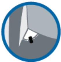
in your pocket (pants or shirt)