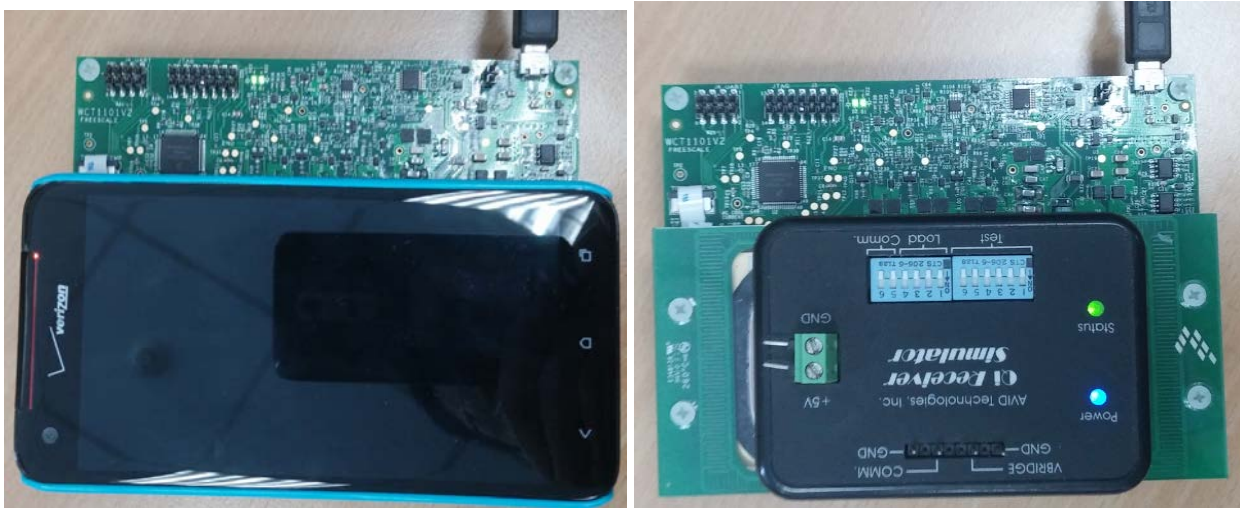
Figure-3 WCT-5WTXMULTI charging the equipments

Step 2: Place the wireless charging RX or some equipment that support the Qi wireless charger(such as cell phone, battery and so on ) on the WCT-5WTXMULTI's coil surface, then the transmitter will charge the equipment, under the normal charging states, LED2 will be turned on all the time, and LED1 will be blanking, and the RX will powered on the equipment normally.