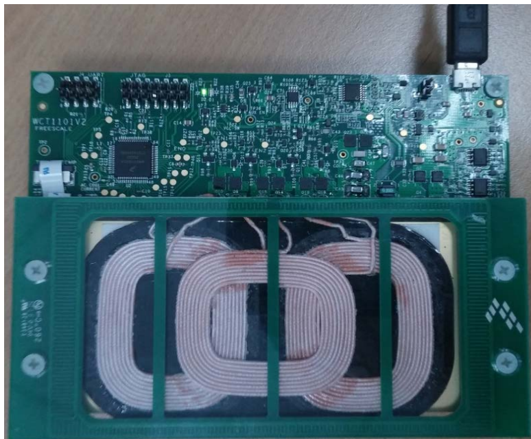
Figure-2 WCT-5WTXMULTI powered on

Step 1: power on the Transmitter, plug the 5V adaptor to the AC power line, and plug the adaptor USB port to the transmitter input port, and the LED2 will be blanking.