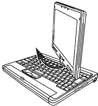
Figure 2-13. Rotating the display