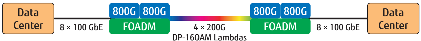
Figure 1: mDCI Application

The Fujitsu 1FINITY™ platform provides a purpose-built metro DCI solution for data center operators that delivers high-capacity for point-to-point functionality. This blade-centric solution comprises high-density transport and FOADM network elements. The 1FINITY T100 blade provides the key to providing dense and efficient transponding of 100 GbE connections onto a DWDM system. With this solution, two 100 GbE connections are aggregated onto a single 200 Gbps, 50 GHz wavelength. The T100 provides industry-leading density in a modular platform that is easily managed with an SDN network controller.