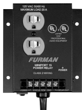
MiniPort Power Relays. 15A, 20A, 30A

The PS-8R, along with other Furman AC power accessories, can be an integral part of a complete AC power control system. Visit our website or contact us— we'll send you our "AC Power System Application Suggestions" brochure, and Furman's new color catalog.