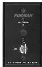
RS-1 and RS-2 Remote System Control Panels