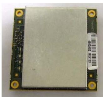
Figure 1. SF9 Transceiver Module

(J3 Data/Power and J200 Antenna Connectors on other side)