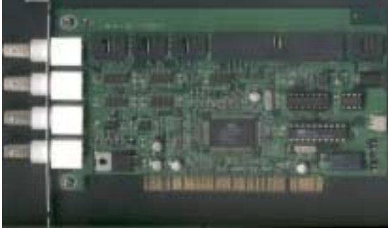
GV- 600 Rev. 2.0