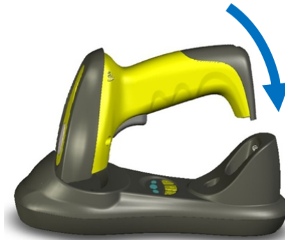
Place the Scanner

Step 2. Put the scanner onto the cradle like below picture.