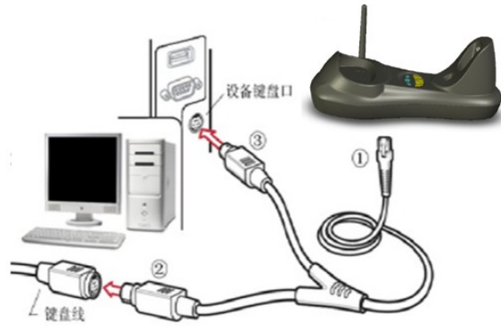
P/S2 keyboard cable

RS232: RS232 cable RJ45 side to connect ⑧, the other side to connect PC.