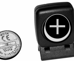
Insert a CR2032 3V lithium battery into the battery well with the writing facing you. Do not touch the two contacts.