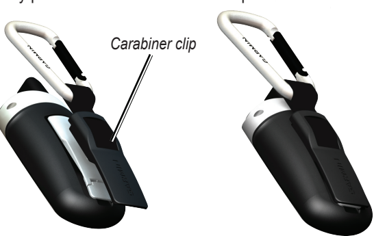
Carabiner Mounted on Colorado