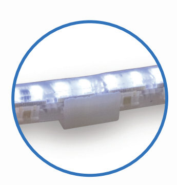
Simple installation using light engine mounting clip in low-profile designs

Contour LS comes in pre-assembled 8-foot (2.44m) lengths