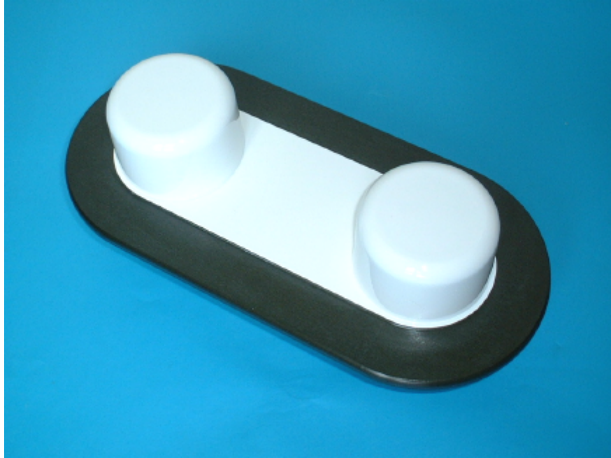
Figure 1. AD510-10 Active Iridium antenna