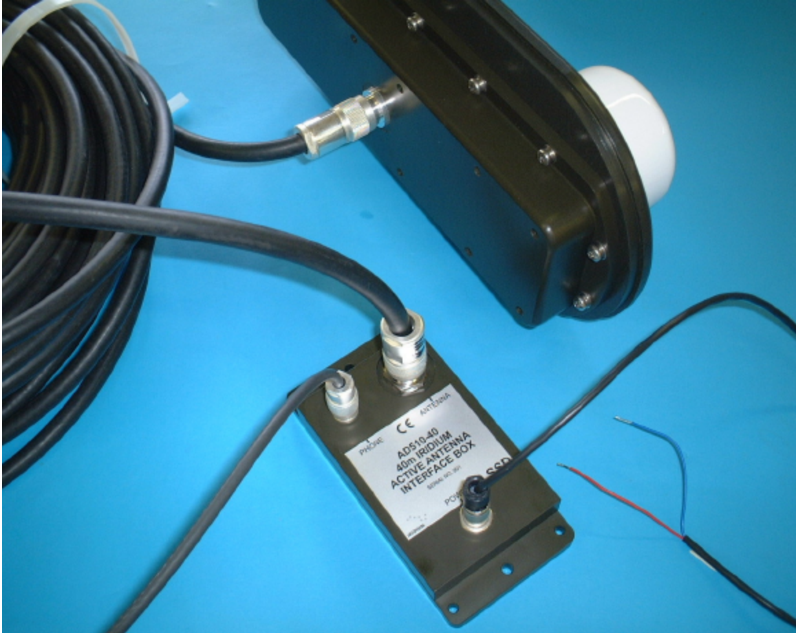
Figure 3. AD510-40 voltage regulator and break-in for use with +9 to 36Vdc supply. The case is hard anodised aluminium and has fixing flanges. A 40m coil of RG213U cable is shown connected to an AD510-10 active antenna (top). The handset interconnect is shown trailing from the TNC to the bottom left, whilst the flying lead for connection to 9 to 36V dc supply is shown cutting the frame to the right.