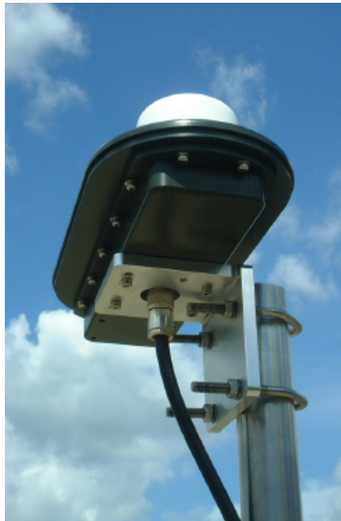
Figure 2. AD510-10 active Iridium antenna with mounting bracket and RG213U coaxial down-lead