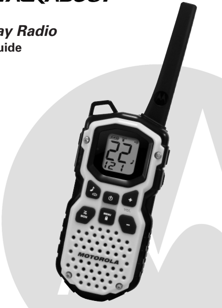
KEM-ML36100-22 MS560 Series

! This radio floats with included NiMH battery. It may not float with some AA batteries.