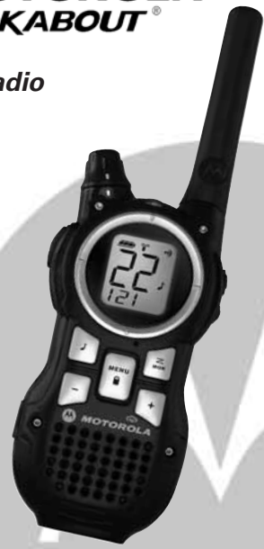
KEM-ML36100-24A MR Series

Do NOT hold the antenna when the radio is "IN USE." Holding the antenna affects its effective range. Body-Worn Operation To maintain compliances with FCC/Health Canada RF exposure guidelines if you wear a radio on your body when transmitting always place the radio in a Motorola-supplied or approved clip holder, holster, case or body harness for this product. Use of non-Motorola-approved accessories may exceed FCC/Health Canada RF exposure guidelines.