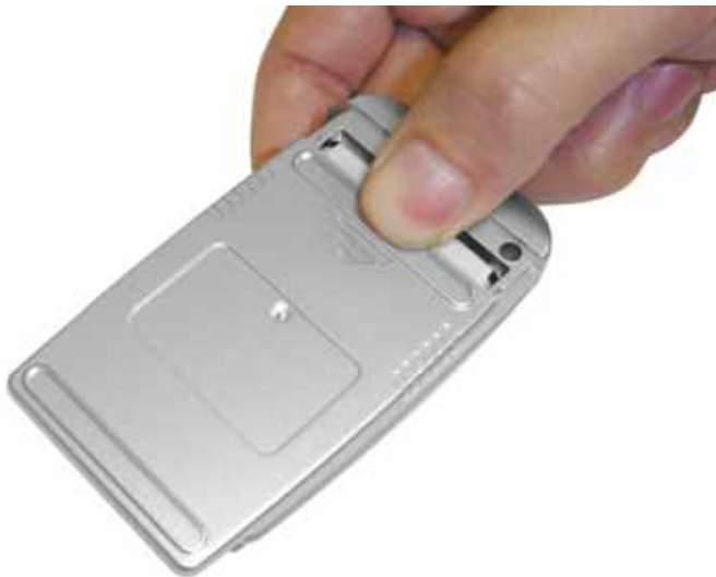
Figure 1 Open the cover of battery