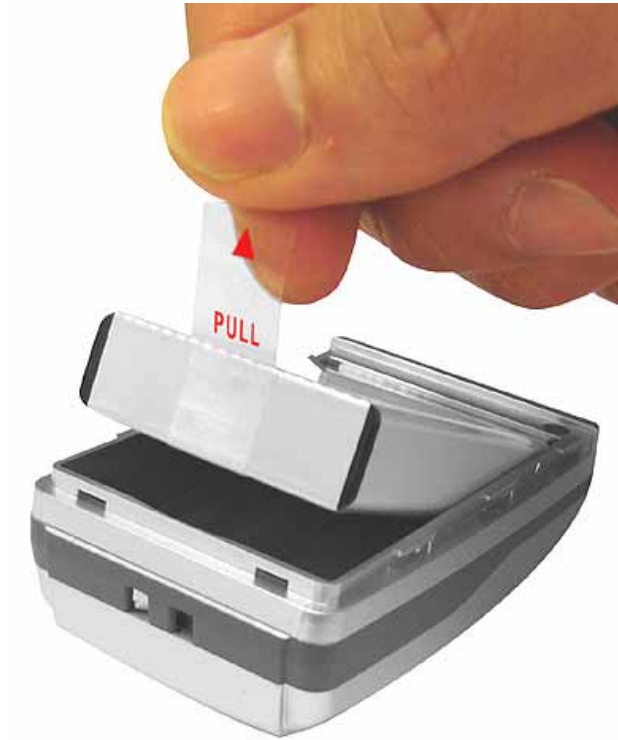
Figure 2 Take out the battery with pull tag