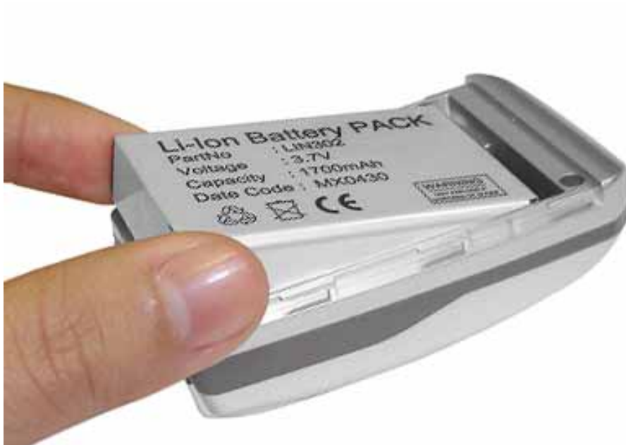
Figure 3 Put new battery into BT-338