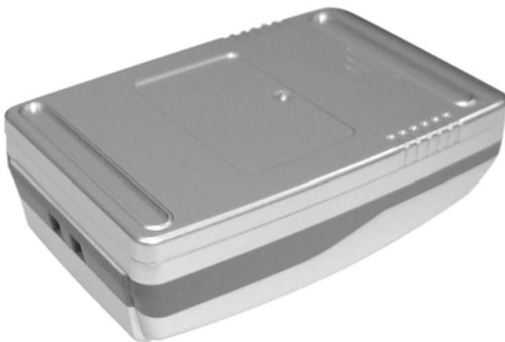
Figure 6 Slide the cover of battery to close