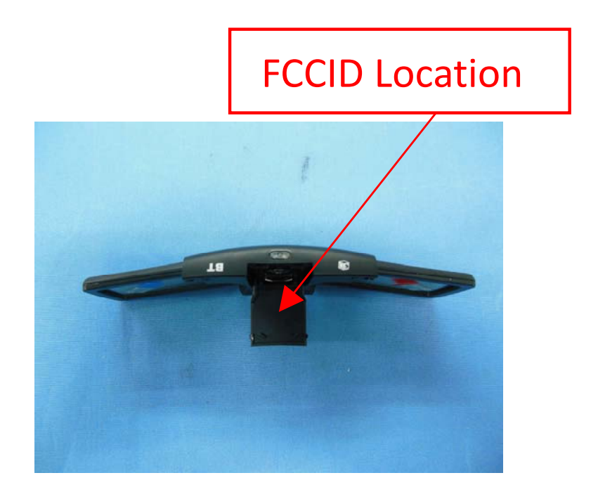
FCC ID Label Sample for FCC ID: 2ABMEG15-BT

To whom use the device The FCC ID Label can clearly visible to the users, when you open the battery back cover.