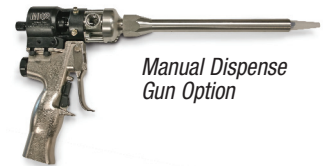
Manual Dispense Gun Option