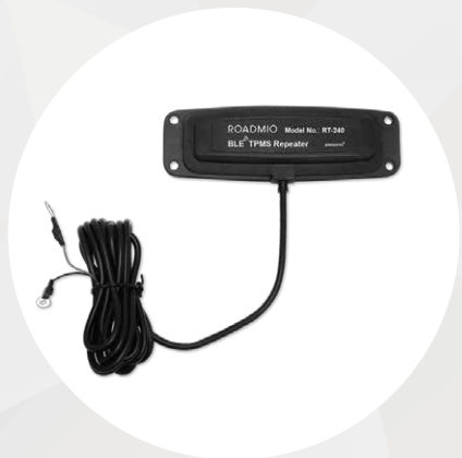
Quick Installation Guide