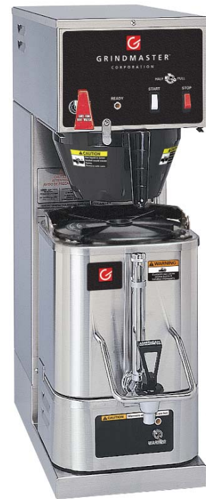
Model RAPS200 Shuttle®/Airpot Brewer

The P200 Shuttle® Brewer consistently delivers perfect coffee. Grindmaster's exclusive air gap insulated Shuttle® maintains the freshness and taste that your customers expect and allows you to transport and serve your coffee safely and easily.