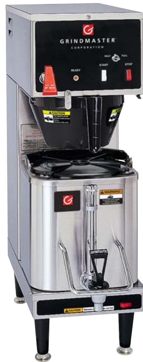
Model P200 Shuttle® Brewer