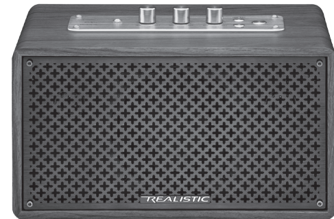
RETRO BLUETOOTH® SPEAKER 4000774 User's Guide

We hope you enjoy your REALISTIC Retro Bluetooth Speaker with elegant cherry wood finishing to provide stunning sound. Please read this user's guide before using your new speaker.