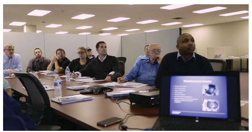
Training Session - Giffin USA, Auburn Hills, MI

Along with the software structure re-design, Advanced Solutions suggested the need for extensive training, utilizing their CAD Club training membership program. This would allow Giffin to have access to unlimited training throughout the year for each designated user. Once these key individuals were properly trained, they could then train the last 10% of the staff with a hands-on, in-house experience. Using their own highly educated professionals, in this way, enabled Giffin to keep training costs low across the organization.