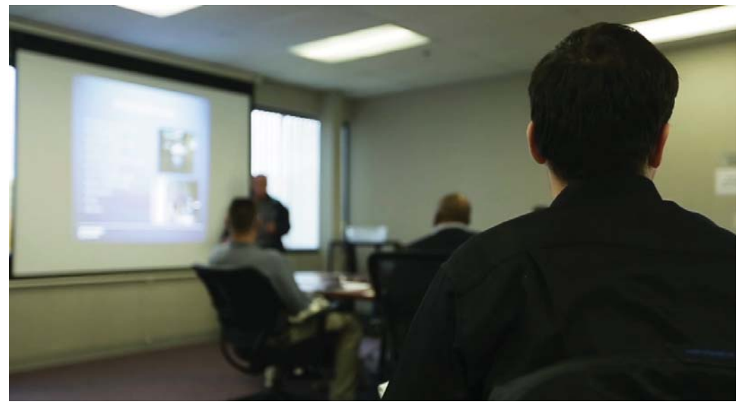
Training Session - Giffin USA, Auburn Hills, MI