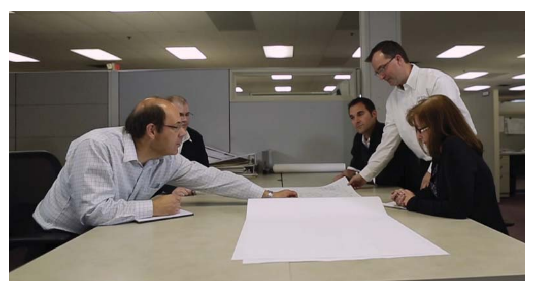
Collaboration Session - Giffin USA, Auburn Hills, MI