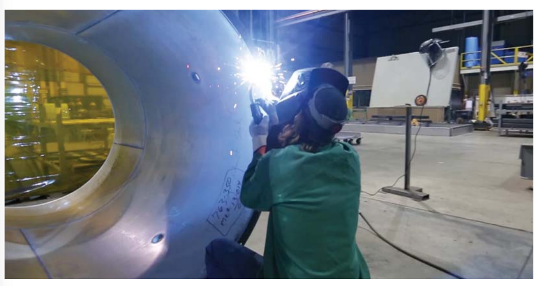
Giffin factory facilities - Giffin USA, Auburn Hills, MI

Giffin, Inc. partnered with Advanced Solutions, Inc. to implement business process solutions through Autodesk<sup>®</sup> software, training, and development.