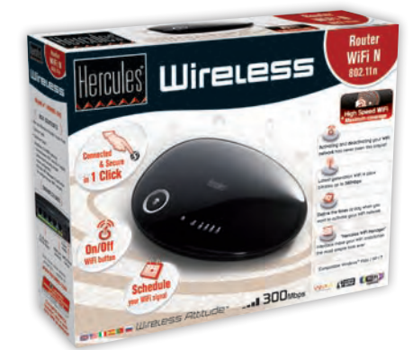
Hercules Wireless N Router (HWNRI-300)