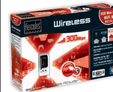
Hercules Wireless N300 USB Mini (HWNUm-300)