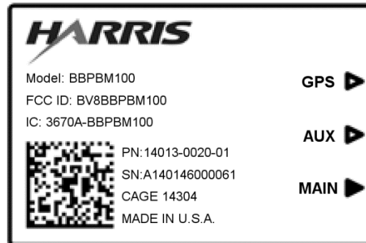
Figure 2-1: FCC Labeling

The FCC labeling of the PEM module is shown below. When integrating the module into a host, the label must be visible through a window, visible through an access panel that is easily removed, or a second label must be placed on the outside of the host device that contains the following text: Contains FCC ID: BV8BBPBM100. Labelling for Canada must include the following text: Contains IC: 3670A-BBPBM100.