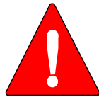
MISE EN GARDE

Les conventions suivantes sont utilisées dans le présent manuel pour avertir l'utilisateur des précautions générales de sécurité qui doivent être observées pendant toutes les phases d'opération, d'entretien et de réparation de ce produit. Le non-respect de ces précautions ou d'avertissements précisés ailleurs enfreint les normes de sécurité de la conception, de la fabrication et de l'utilisation prévue du produit. Harris n'assume aucune responsabilité pour le non-respect de ces normes par le client.