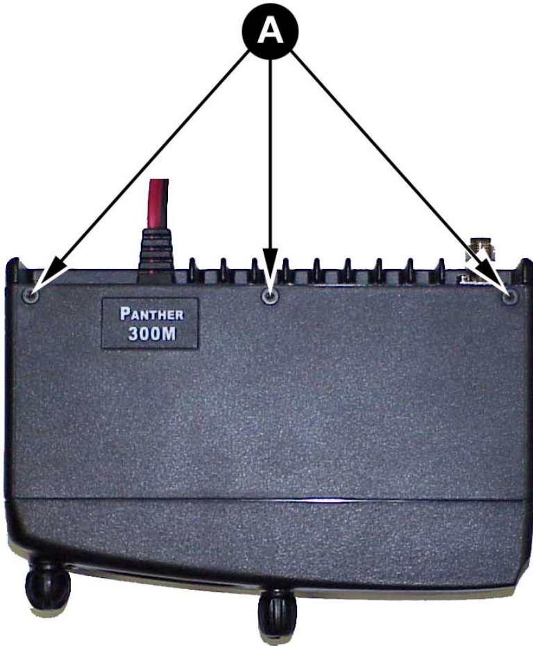
Figure 2 – Removing Top Cover