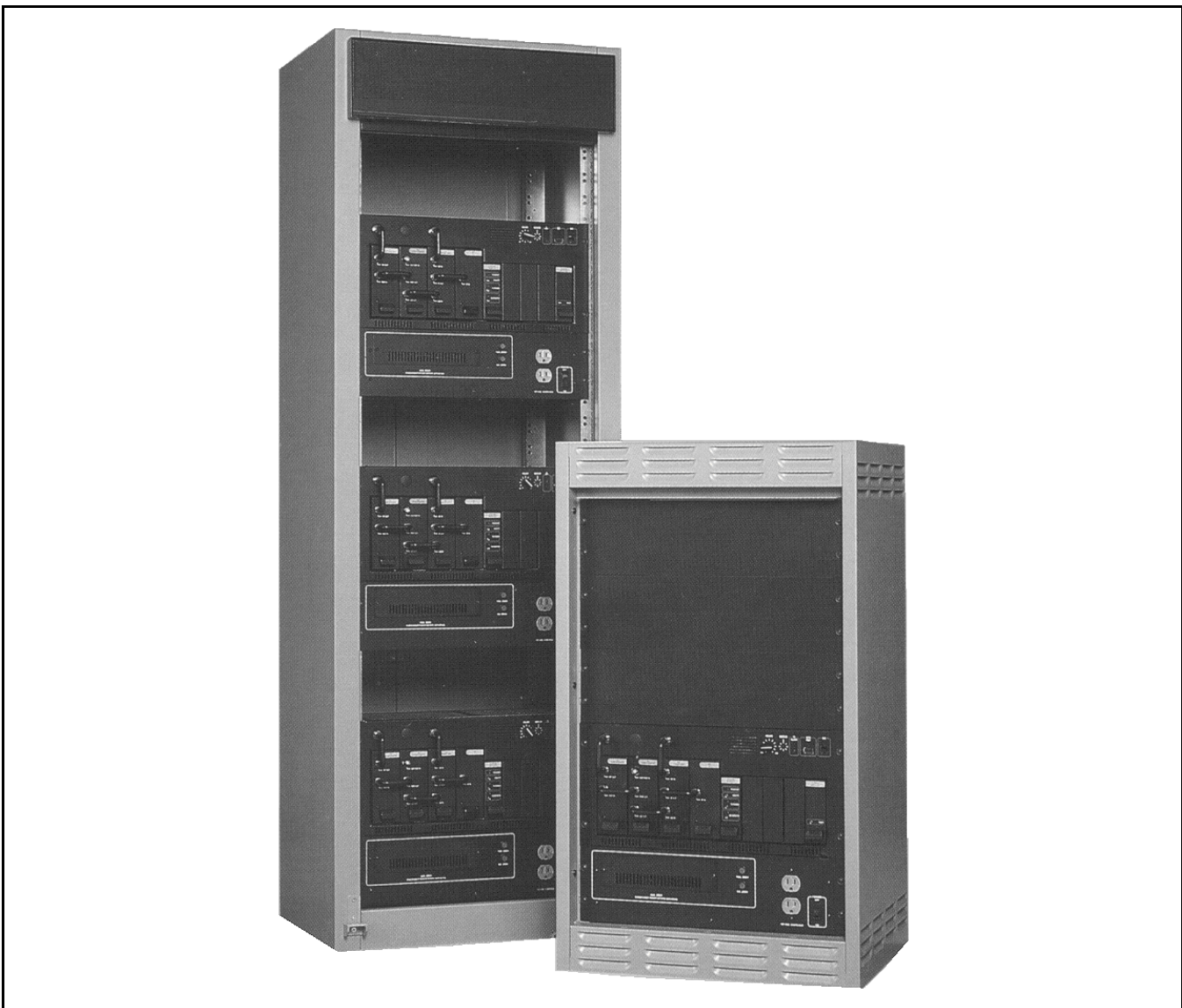
Figure 1 - 69" & 37" Cabinet Mount