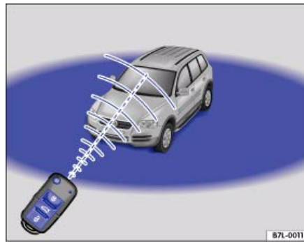
Fig. 25 Range of remote control