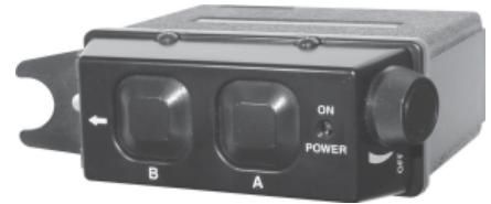
Figure 1. COM2000BP COMMUNICATOR®