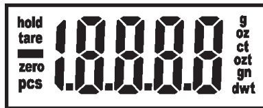
Figure A: Startup Screen

hold - Indicates that the reading is stable.