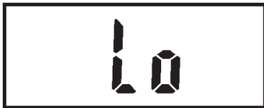
Figure C: Low Battery

Note: If battery is low, Lo (Low Battery) will be shown. See Figure C.