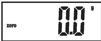
Figure B: Scale ready

Note: If battery is low, Lo (Low Battery) will be shown. See Figure C.