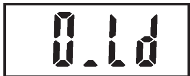
Figure D: Overload

Note: If too much weight is placed on the platform, the display will read O,Ld (Overload) as shown below.