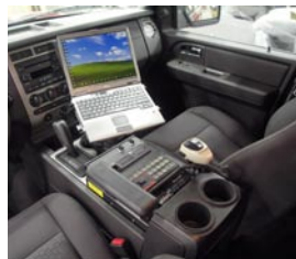
2007-2008 Expedition C-VS-1200-EXPD-1