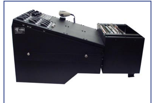
Angled towards driver making vital equipment easier to see and quicker to reach.