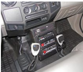
2008 F-250 Pick-Up C-VS-1200-F250-1