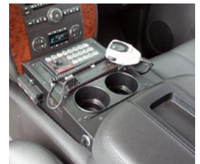
2007 Tahoe/Yukon/Suburban C-VS-1000-TAH

Call Today for Quick Delivery 1-800-524-9900 or visit www.havis.com