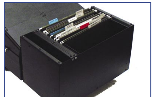
Accessory Pocket Options (C-D-AP-FS shown) Also available without File Storage (C-D-AP)