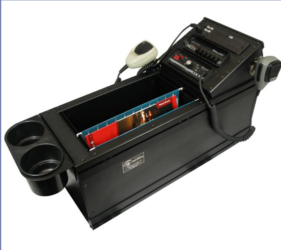
Universal SUV or Truck Application (C-AB-825-H Angled Adapter on a C-2410 Console)