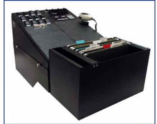
Double or Cab Console (C-D2300-FL1 Freightliner M-2 Console with accessory pocket option C-D-AP-FS shown)