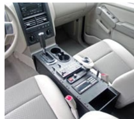
2006-2008 Explorer C-VS-1600-EXPL