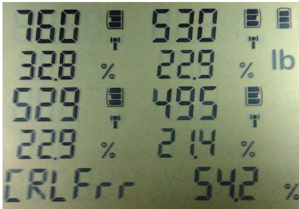
Cross Left Front, Right Rear percent