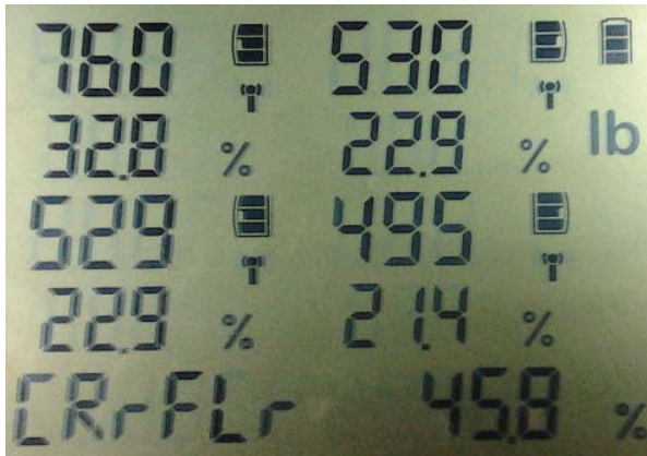
Cross Right Front, Left Rear percent