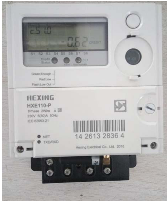
Installed in the sample