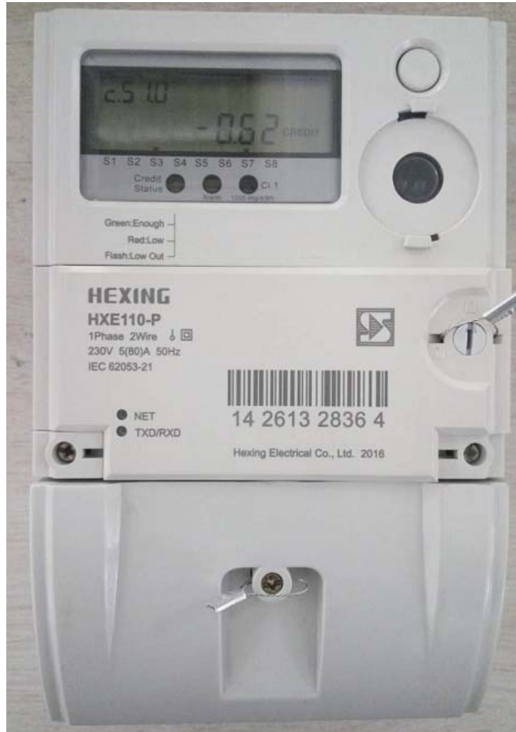
Installed in the sample

Electric meter models only for reference.