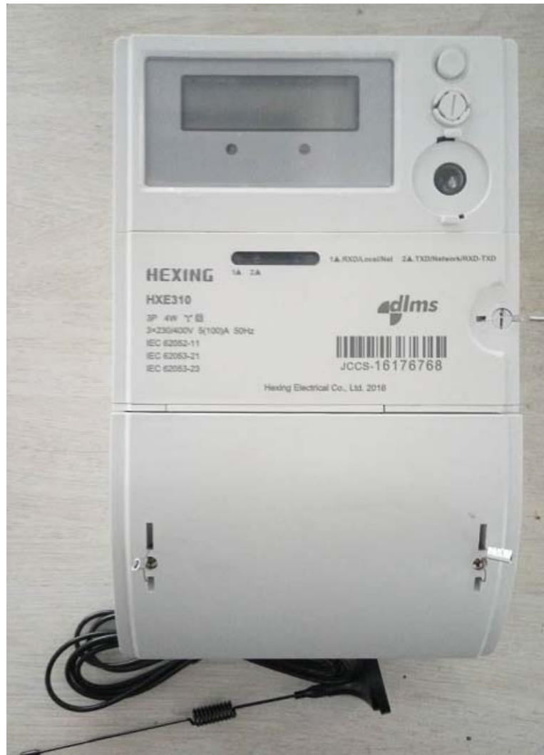
Installed in the sample

Electric meter models only for reference.