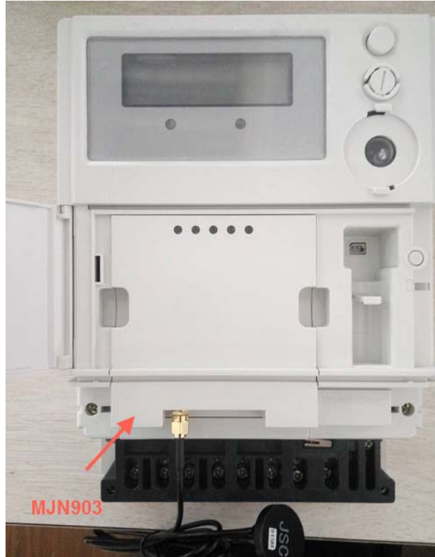
Installed in the sample