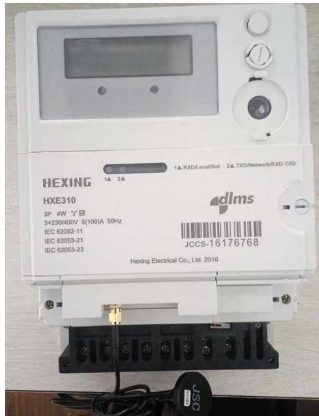
Installed in the sample