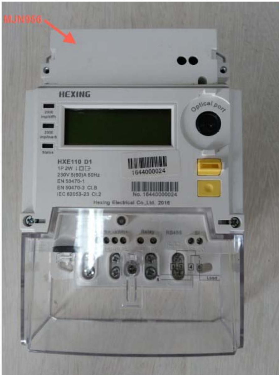
Installed in the sample