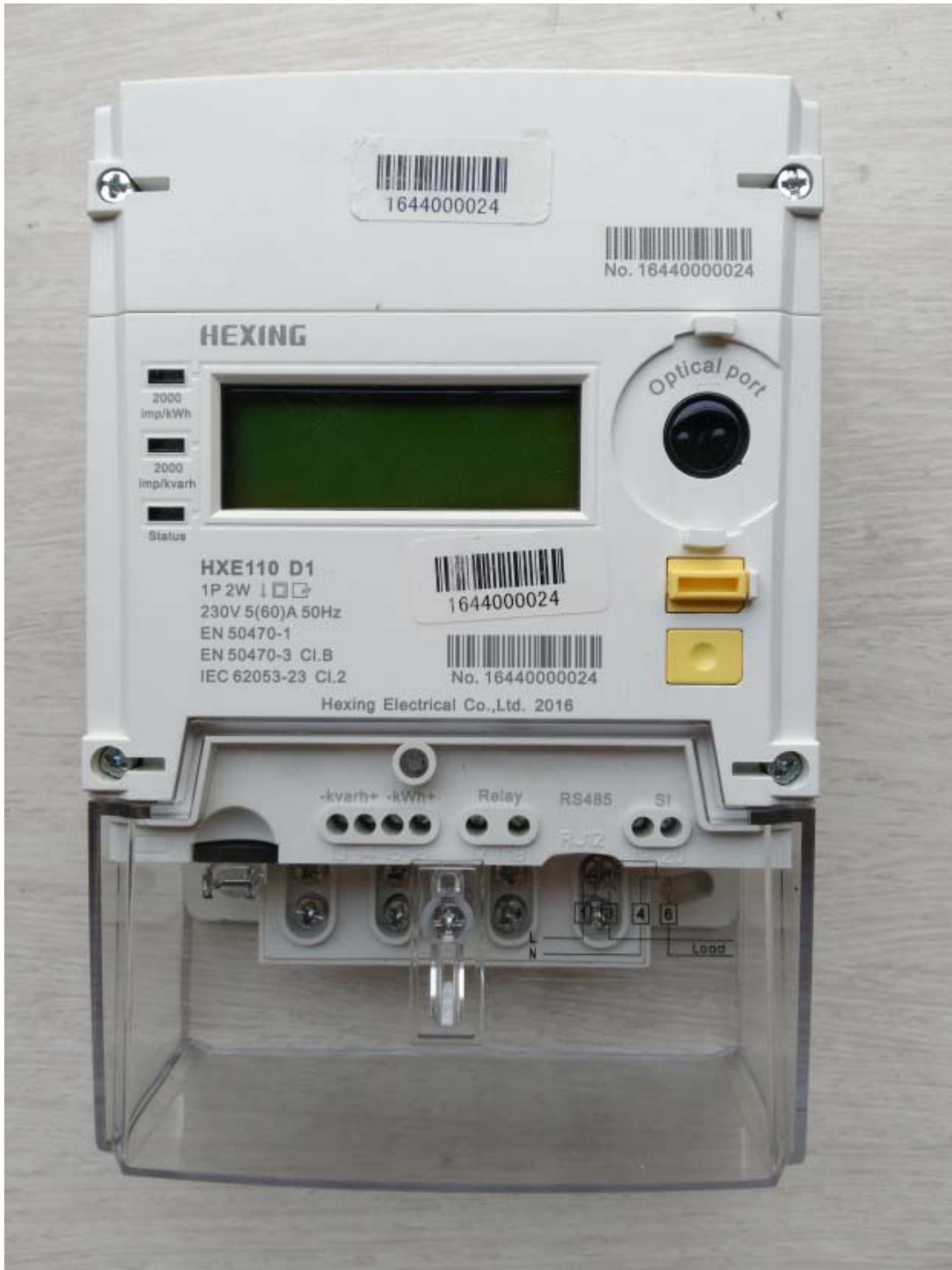
Installed in the sample

Electric meter models only for reference.