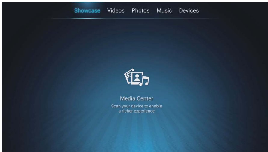
Figure 41. Media Center Home Page