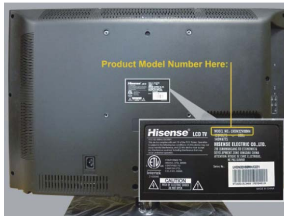
Figure 43. Model Number Location

To locate the serial number for your TV, look in one or all of the following places: