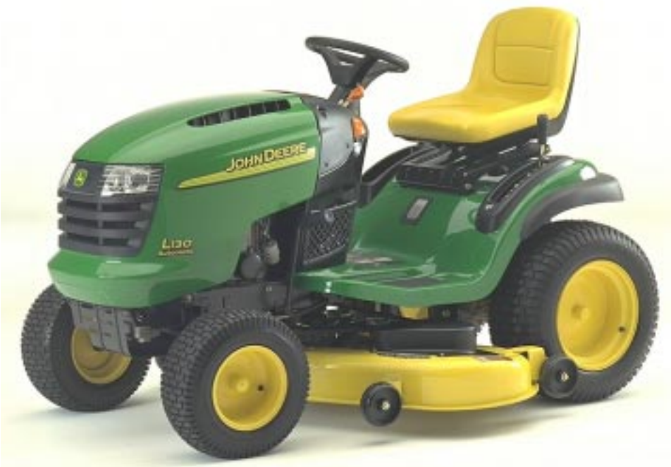
L130 Hydrostatic Drive Deluxe Lawn Tractor, 23 Horsepower and 48-in. Mower Deck