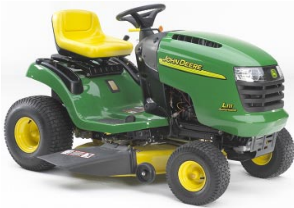
L111 Hydrostatic Drive Lawn Tractor, 20 Horsepower and 42-in. Mower Deck