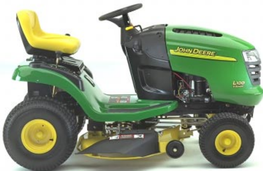
L100 5-Speed Gear Drive Lawn Tractor, 17 Horsepower and 42-in. Mower Deck