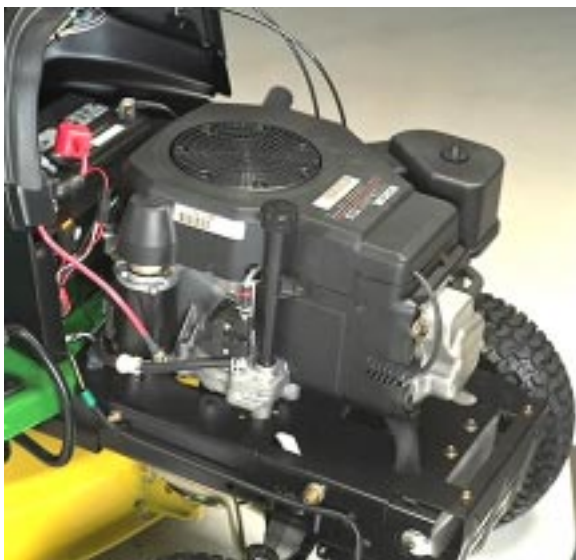
L110 17.5 horsepower Kohler engine shown

The John Deere L Series Lawn Tractors use Briggs & Stratton and Kohler engines. These engines provide plenty of power and torque to handle tough mulching, mowing, and bagging conditions.