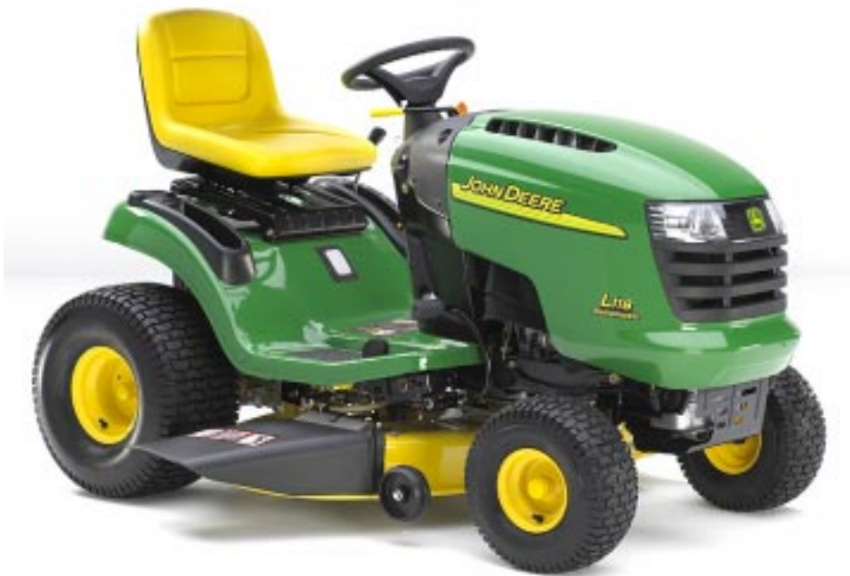
L118 Hydrostatic Drive Lawn Tractor, 22 Horsepower and 42-in. Mower Deck