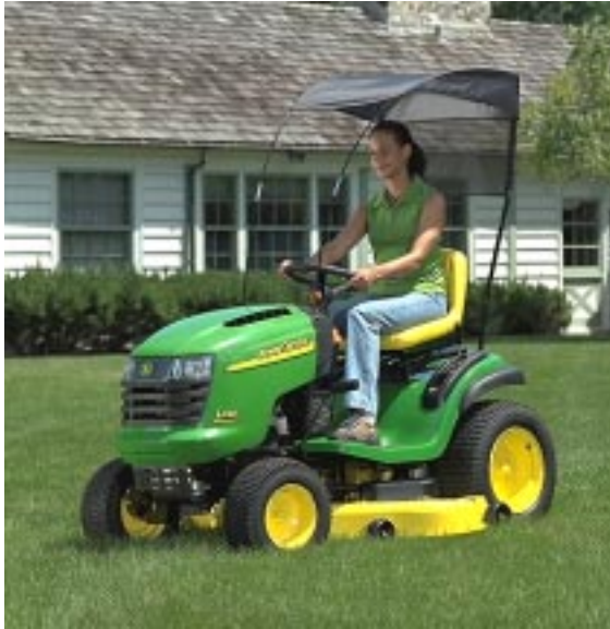
L130 Lawn Tractor shown with optional Sun Canopy

The John Deere L Series Lawn Tractors are recommended for value-conscious homeowners who mow up to: