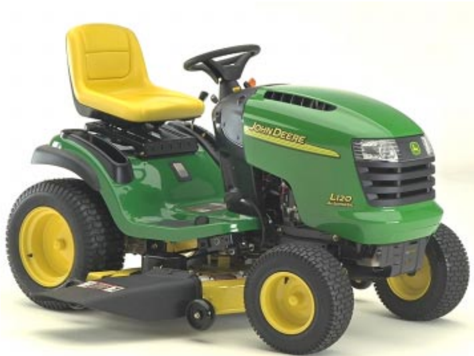
L120 Hydrostatic Drive Deluxe Lawn Tractor, 22 Horsepower and 48-in. Mower Deck