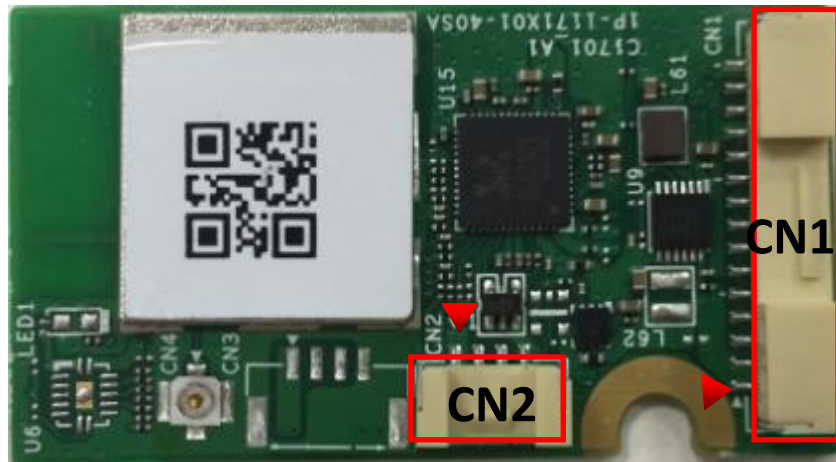
Figure 1 Pin Definitions (Module Top View)