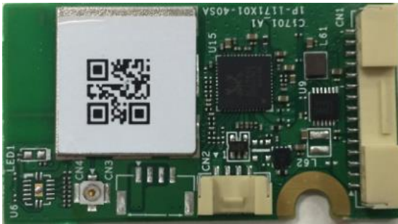
Figure 2 Top Side Photo