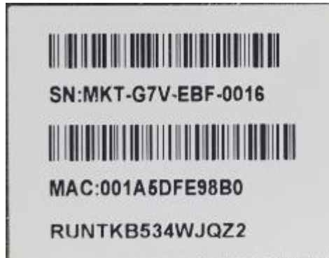
Figure 4 Label Drawing (TBD)