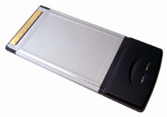
Figure 1-1 WCB-G03H Appearance