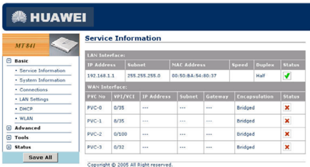
Figure 3-1 Layout of Web-based Configuration Manager

Click the WLAN of Basic in the Wizard Column to set the WLAN configuration.