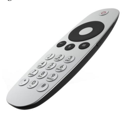
Figure 2-2 Remote control