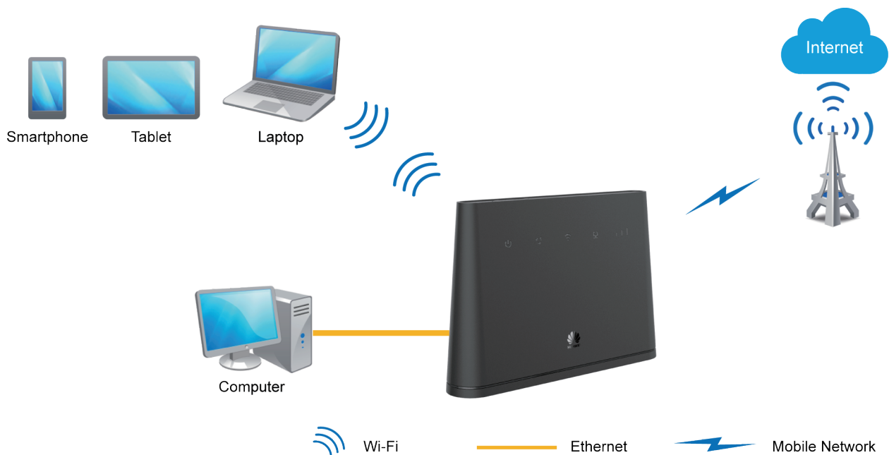
Figure 4-1 Accessing the Internet through a mobile network

The B310s-22 can access the Internet through mobile networks.