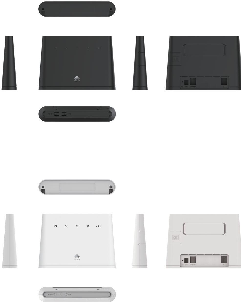
Figure 1-1 B310s-22 appearance