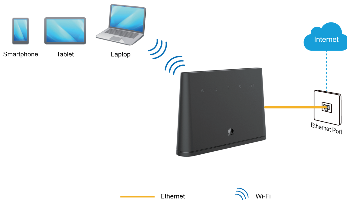
Figure 4-2 Accessing the Internet through an Ethernet network

Connect the B310s-22's WAN/LAN port to a wall-mounted Ethernet port using a network cable.