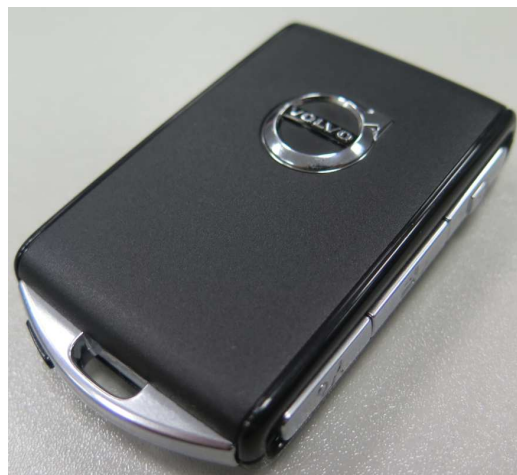
Volvo SPA Standard Key HUF8423, HUF8424, HUF8425