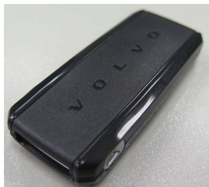
Volvo SPA Tag ID HUF8432, HUF8433, HUF8434