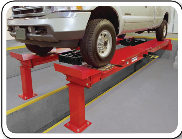
P444 Pit Installation