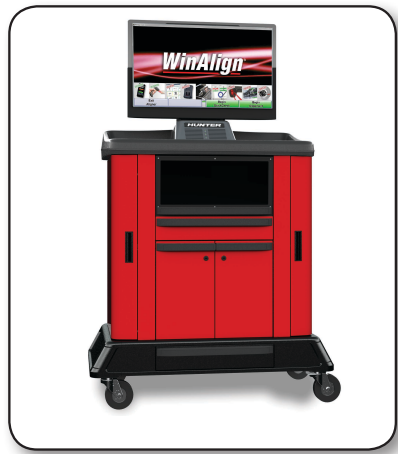
For combination light/heavy duty systems only