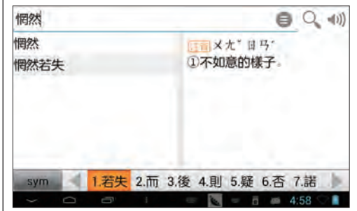
L Input words

Insert the word You can change the cursor position to change the input position