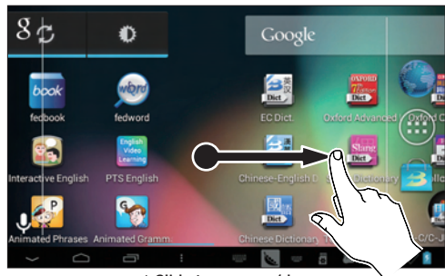
£ Slide to page up/down